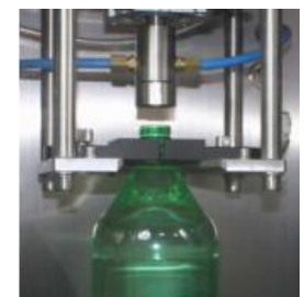
Auto Sample Clamping Auto Water Fill Auto Testing