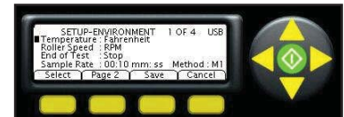
◀ Sample Menu Setups