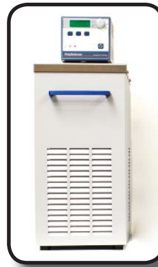
▲ Constant Temperature Circulator (CTC)

Approx. Gross Weight: 300 lbs (136.08 kg) including CTC