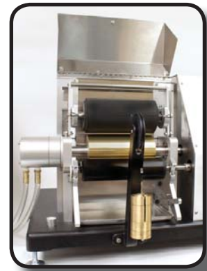
▲ Calibration Weights in Place Included with Package