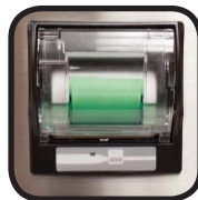
Printer with Sample Data

The Inkometer 1100 multi-line display shows the temperature, tack, roller speed and test time. Tack readings can be exported to the RS-232 port, the integrated printer or to a USB flash drive. Statistical reports can be viewed directly from the display. The Inkometer provides four test methods based on ASTM D-4361 as well as five user configurable methods that are stored in non-volatile memory.