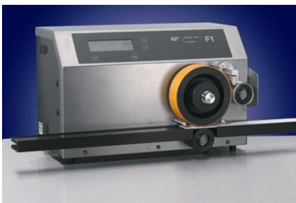
The F1, origin of the F1 Basic

This makes the F1 Basic a very simple and user-friendly, reliable and consistent printability tester for flexo with high accuracy and consequent fast return on investment.