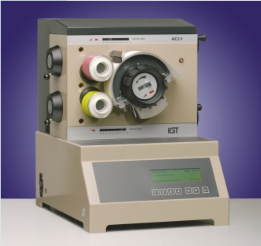
The IGT AIC2-5 suitable for many test purposes