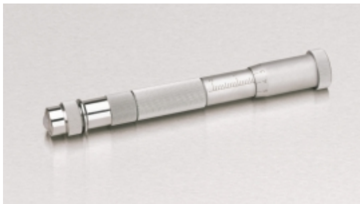
IGT Ink pipette

The use of an IGT ink pipette to apply offset ink to the inking unit is strongly recommended because it increases the accuracy of application of ink and therefore the inking, thereby enhancing the performance of the tests.